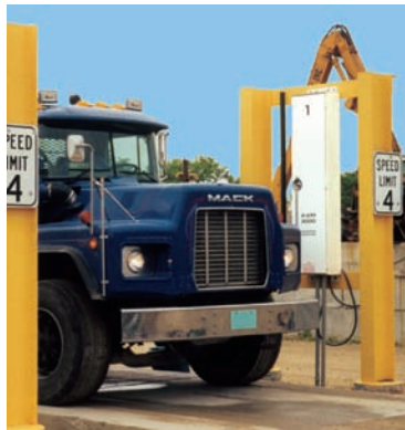
ASM Portal for high-sensitivity truck monitoring – the most reliable 1st line of defense

No need to fetch a bulky detector – the RadEye is always with you