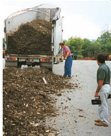
A rejected load of scrap - RadEye helps avoid this problem!

The RadEye PRD offers scrap yards and recycling facilities a cost-effective solution to the threat of radioactive contamination. With its low cost of ownership, durability and portability, the RadEye is the next generation of portable instrument solutions. Thermo Scientific's new RadEye allows facilities to increase the amount of radiation coverage, therefore reducing the likelihood that radioactive material will find its way inside a site.