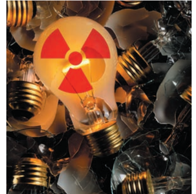
You can't see radiation by looking... but the RadEye can!

The RadEye, on the other hand, is worn on the users belt at all times, weighs a few ounces, and is about the size of a pager. The unit is so