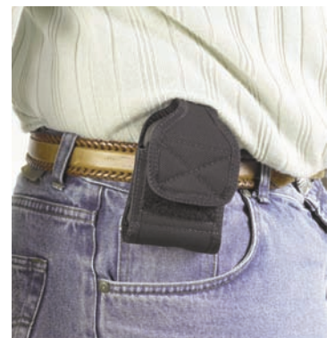
15 full weeks of operation at 40 hours of usage with a single pair of AAA batteries

The characteristic features of this versatile new generation pocket meter are the use of sophisticated low-power technology components and fully automatic self checks which result in minimum maintenance.